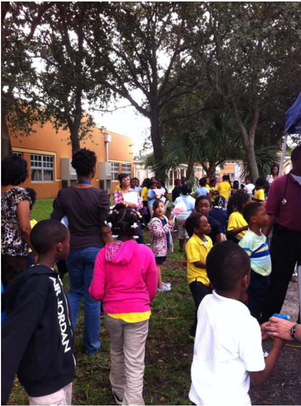
Students waiting in line for cotton candy or sno-cones