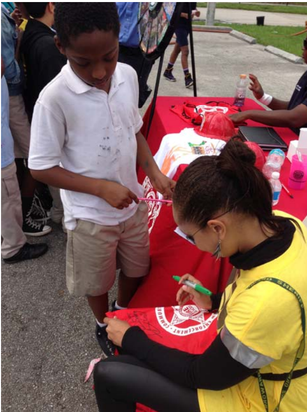
Receiving an autograph and safety tip from Super Safety Girl