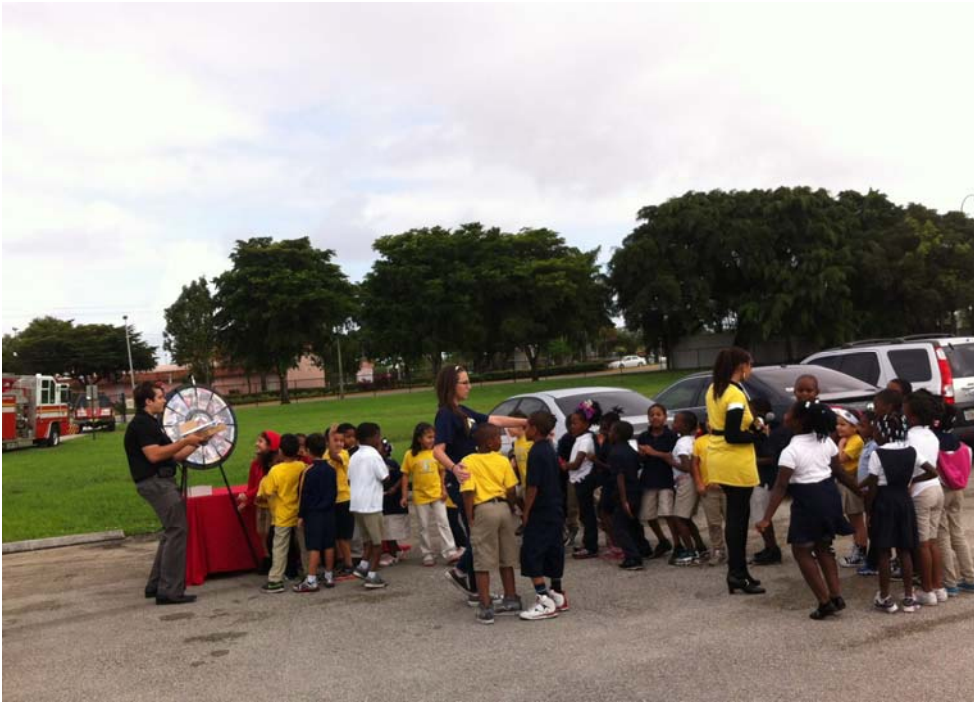
Students playing a spin-the-wheel safety game