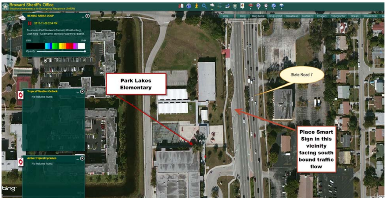
Smart Sign Placement