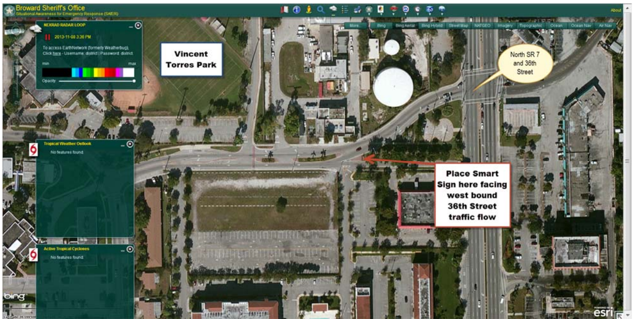
Smart Sign Placement