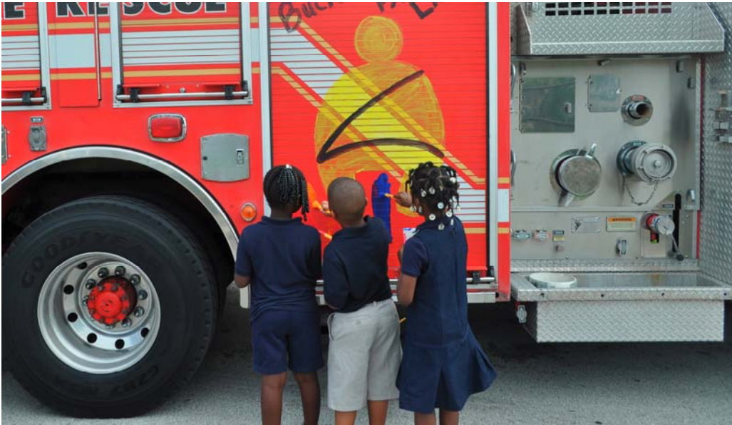
Students painting safety messages on the Paint-the-Truck