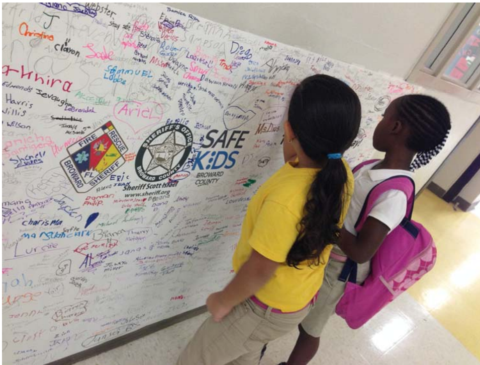
Students signing one of the three pledges